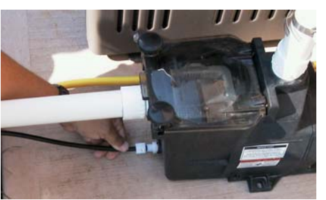
Strainer Basket Installation