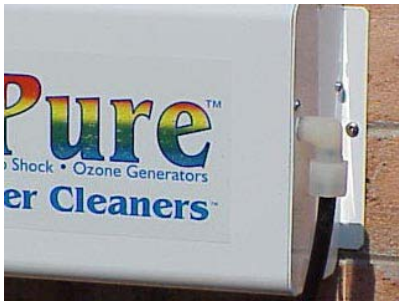
Insert Tubing in Glow Fitting Elbow & Start Pump